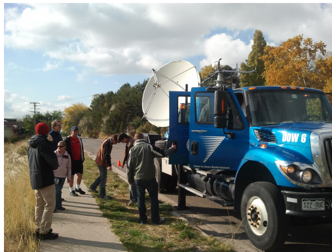
Figure 4. DOW operations on 13 th Ave (near the University of Utah campus) for students who were unable to attend other deployments.

An archive of data collected during the DOW visit has been created on the Department of Atmospheric Sciences computer system, which is accessible from iMac computers in the Department computer classroom. We are presently working to navigate and georeference this data, after which it will be available for classroom use, graduate student research, and undergraduate capstone projects.