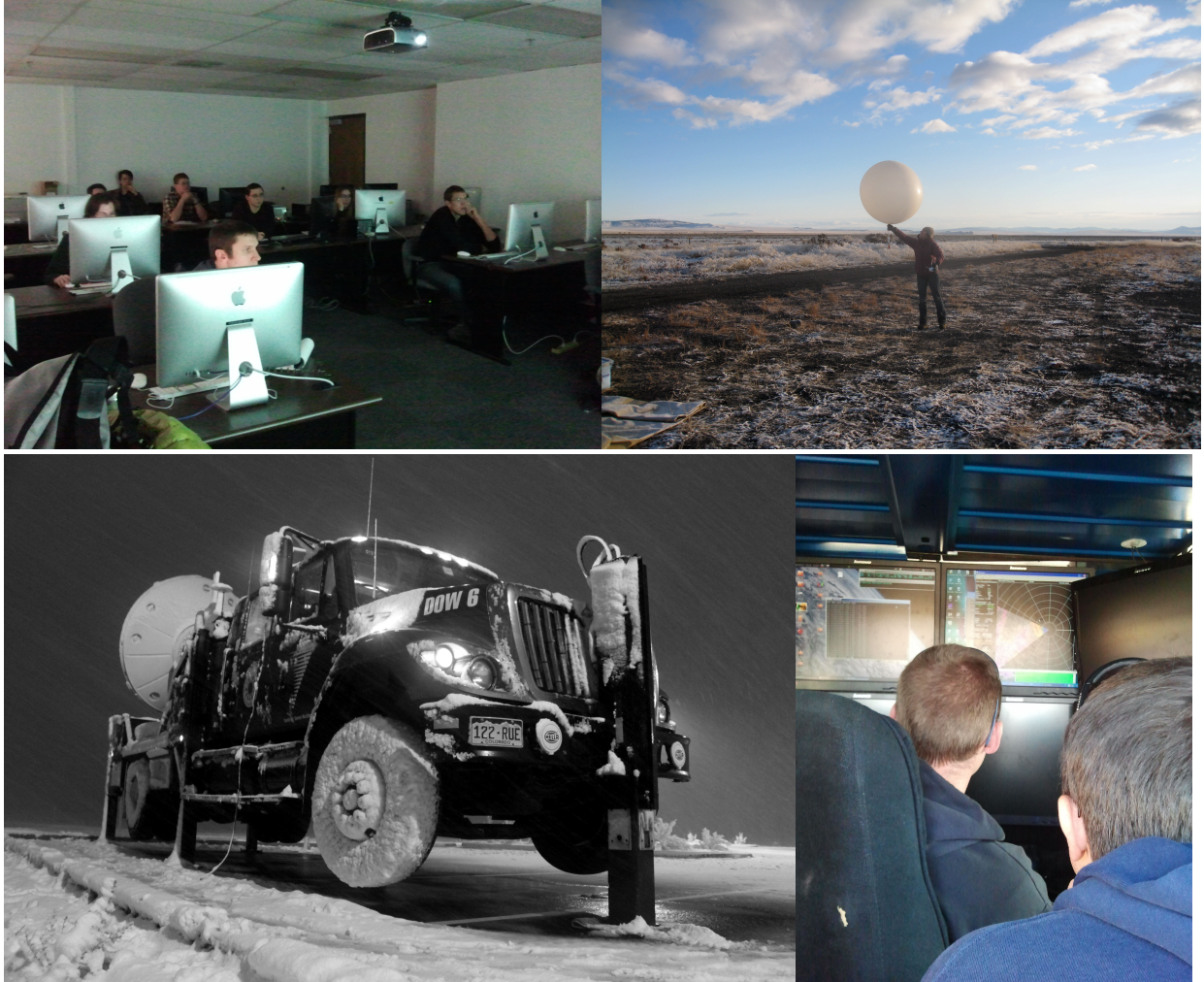
Figure 1. DOW photo collage. Upper left: Pre IOP planning (photo credit: J. Steenburgh). Upper-right: GPS-sounding launch near Kelton on the north end of the Great Salt Lake during IOP5 (photo credit: C. Wall/C. Ander). Bottom left: DOW6 during IOP8 (photo credit: T. Alcott). Bottom right: DOW training first full day of the visit (photo credit: J. Steenburgh).

DOW deployments were classified as either Educational Observing Periods (EOPs) or Intensive Observing Periods (IOPs). EOPs were training focused and designed primarily for students to learn how to deploy and operate the radar. IOPs involved deployments to examine specific weather phenomenon and were more strongly concentrated on education in radar interpretation and mountain meteorology, with an additional goal of obtaining high-quality datasets for future student research projects. A total of 4 EODs and 8 IOPs were executed (Table 1).