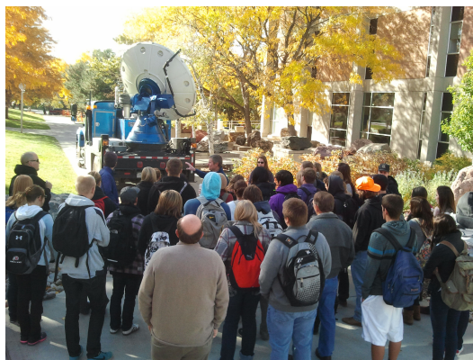
Figure 3. Lecture and tour for Atmos 1010 (Severe and Unusual Weather) students.

Educational and outreach deployments (EODs) included a sidewalk demonstration on 27 Oct of DOW6 next to the primary buildings housing the College of Mines and Earth Sciences. Students enrolled in Atmos 1010 (Severe and Unusual Weather) received a sidewalk lecture from PI Steenburgh and then group tours of the DOW and radar imagery (Fig. 3). Students enrolled in Atmos 5110/6110 (Synoptic-Dynamic Meteorology) received a similar tour. Roughly 200 students and walk-up visitors were given tours.