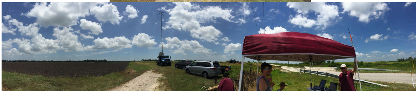
Figure 2. DOW7 deployment site near Alvin, TX.