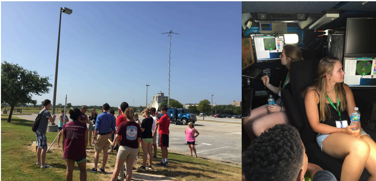
Figure 5. YAP campers on Texas A&M campus.

Wednesday, 29 July was the RADAR day for our YAP camp, combining a field deployment of DOW with usage of our own fixed S-Band Radar, ADRAD (Fig. 5). Two factors shaped our utilization of DOW for that day in execution: First, DOW had experienced a major failure of systems, enabling no storage of collected data and limiting operation to approximately a 30 degree pie wedge facing the rear of the truck. Second, the weather continued to offer little to no appropriate targets. The decision was made to use DOW in the morning mostly in a show-and-tell mode, but utilizing the most observations in conjunction with in-situ instruments at different heights manned by the high school students. This allowed DOW to begin its trip home a little earlier, which was favorable to the schedule of Ms. Gilliland. RADAR day continued in the hot afternoon with ADRAD.