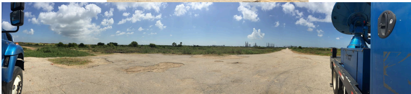
Figure 1. DOW7 deployment site near TAMU Galveston campus.