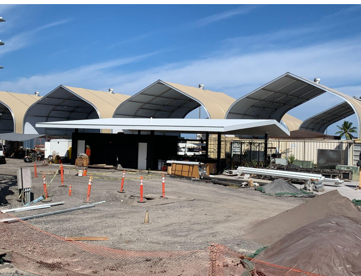
ASH Outdoor Area